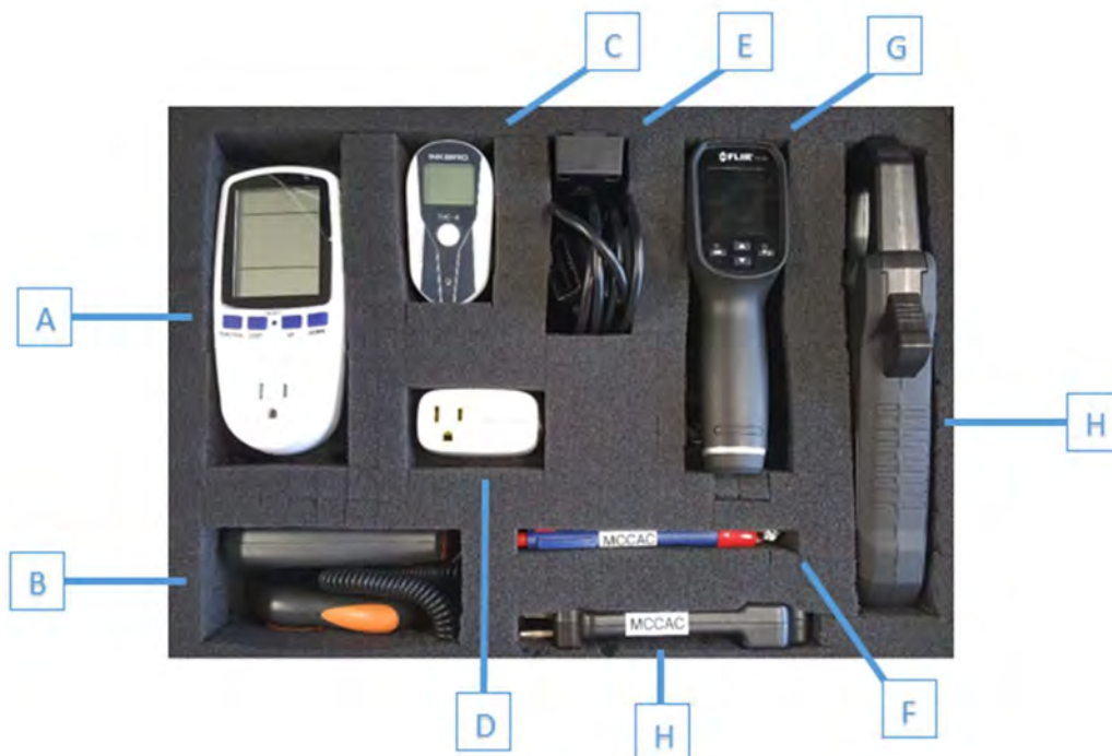
Figure 1: Toolbox contents