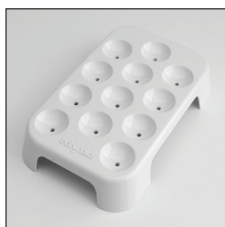
Cooling Rack and Cake Pops Stand