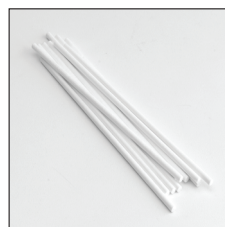
Cake Pops Sticks

This appliance is for HOUSEHOLD USE ONLY . It may be plugged into an AC electrical outlet (ordinary household current). Do not use any other electrical outlet.