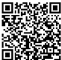
Amira Menu Settings Chart